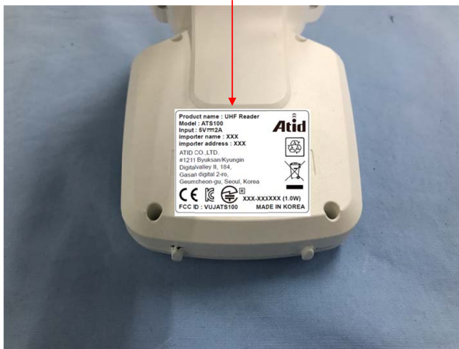
FCC ID Label Location