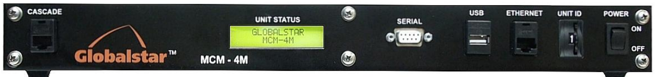
Figure 1-2 MCM-4M Multi Channel Modem – Front Panel