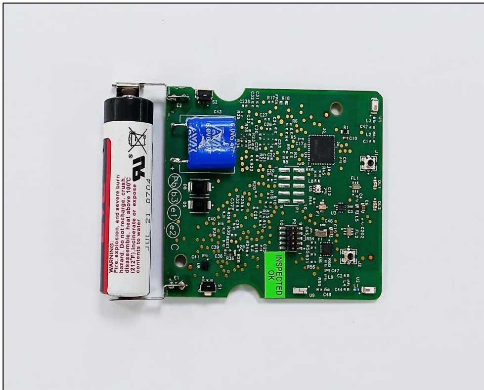
Figure 6: Rear view of the PCB with 3.6V Battery