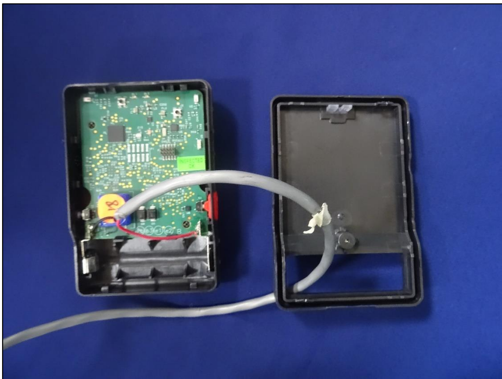
Figure 1: EUT with enclosure