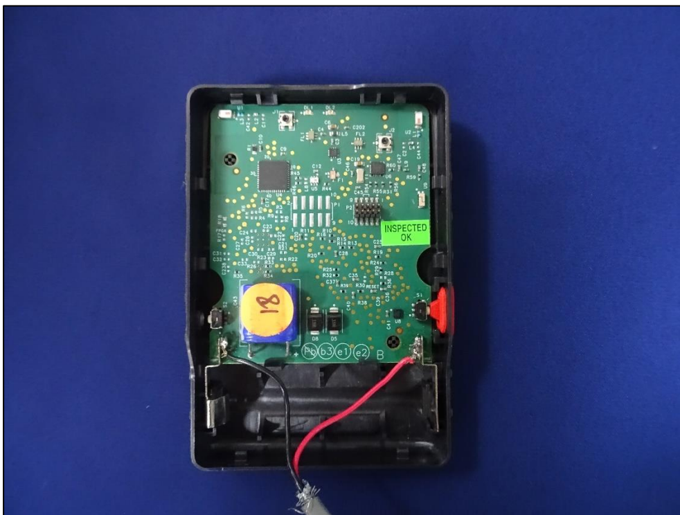
Figure 2: PCB o EUT with enclosure