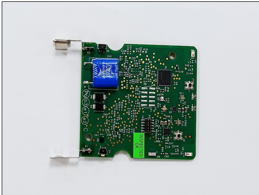
Figure 4: Rear view of the PCB