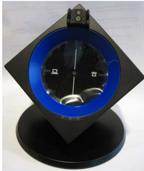
OR BS BLUE US Front view: