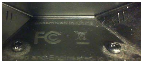
CE and WEEE logo on BS: