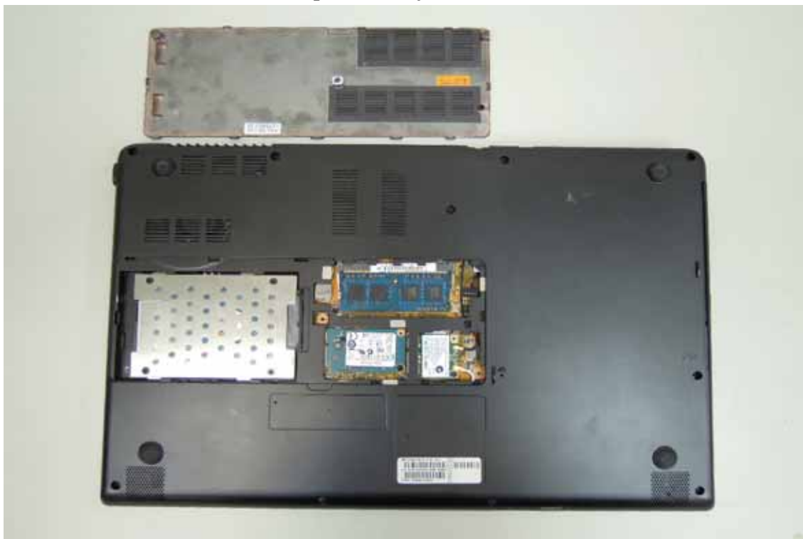
Open View of EUT – 2