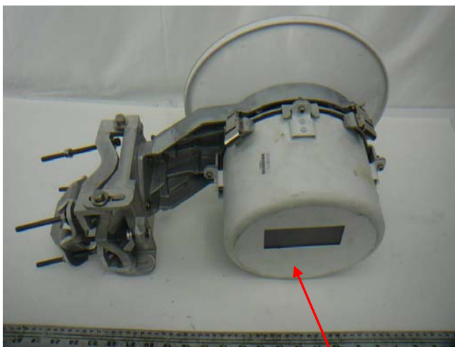
1 ft, 45 dBi Antenna