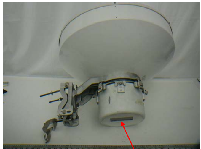
2 ft, 51 dBi Antenna