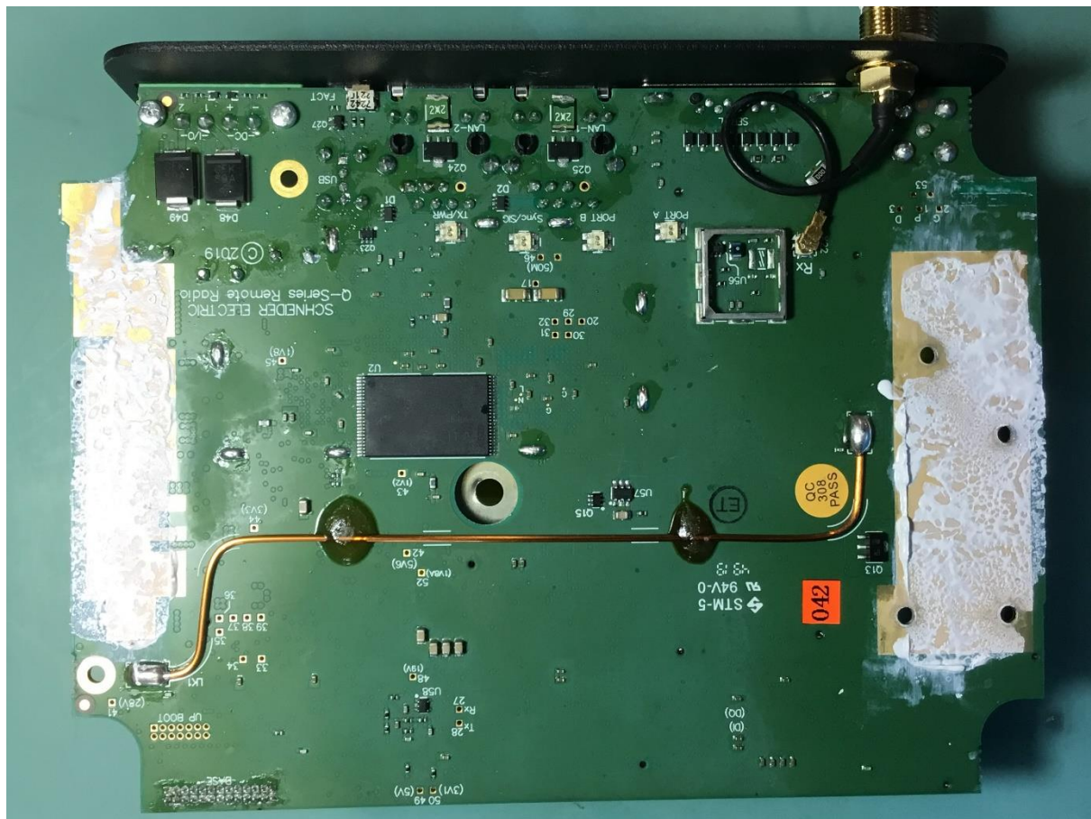
Figure 4 Bottom Side - Shields off