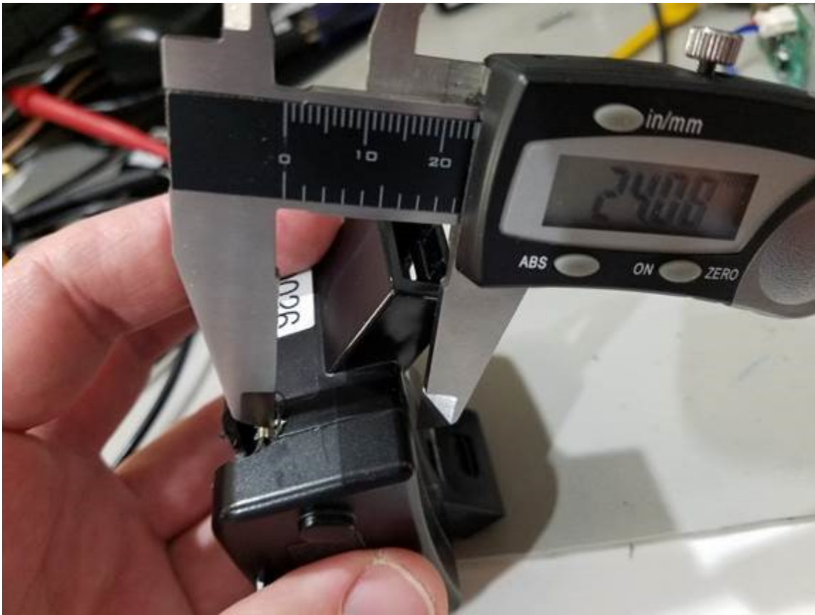
Distance of the Antenna from the User Shown on the Calipers