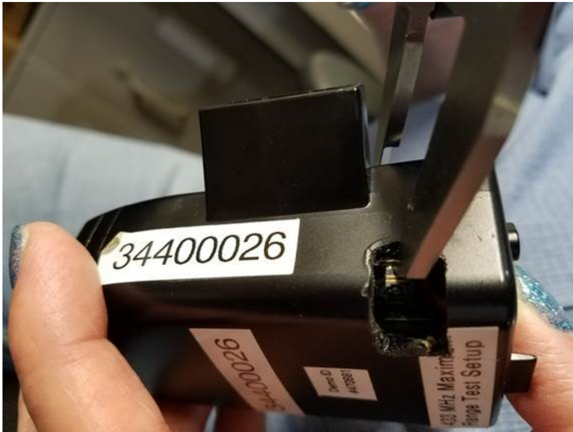
Calipers at the base of the Antenna