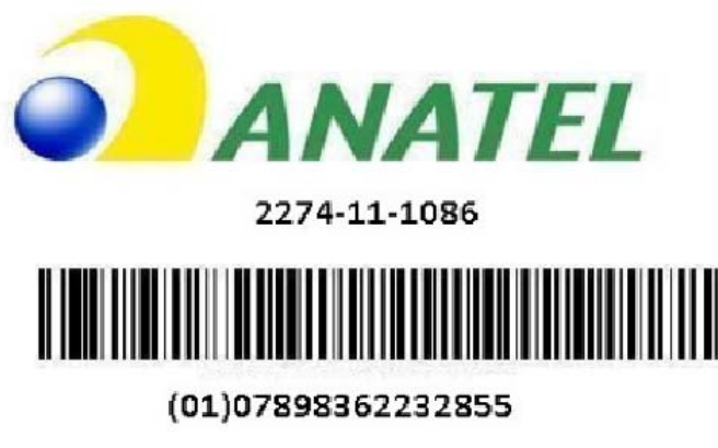
Figure 5 Brazil Regulatory Information