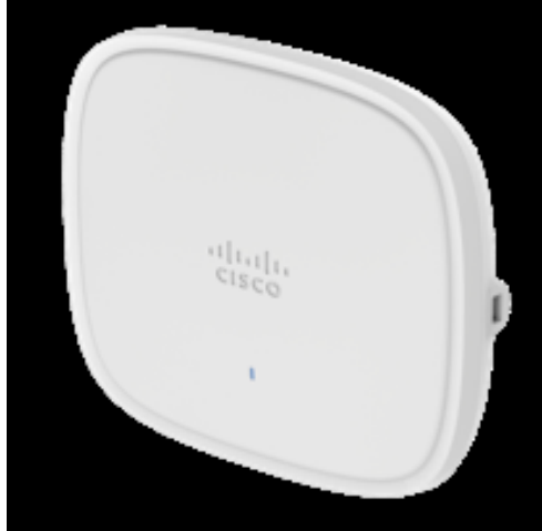
Figure 1 Face of the 9117AXI Model