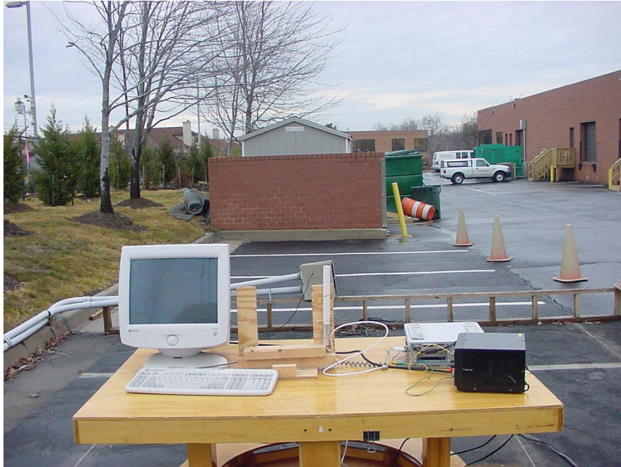
PHOTOGRAPH 12: RADIATED EMISSION REAR VIEW AIR-ANT2506