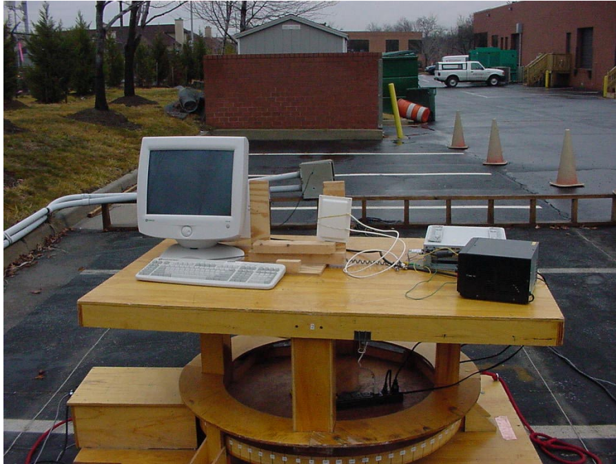
PHOTOGRAPH 8: RADIATED EMISSION REAR AIR-ANT2012