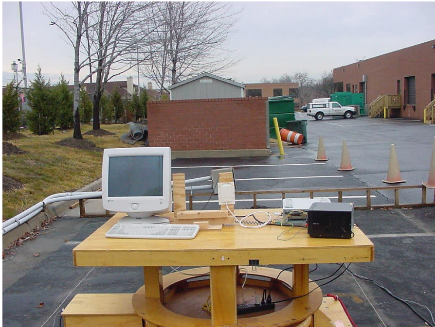
PHOTOGRAPH 10: RADIATED EMISSION REAR AIR-ANT1729