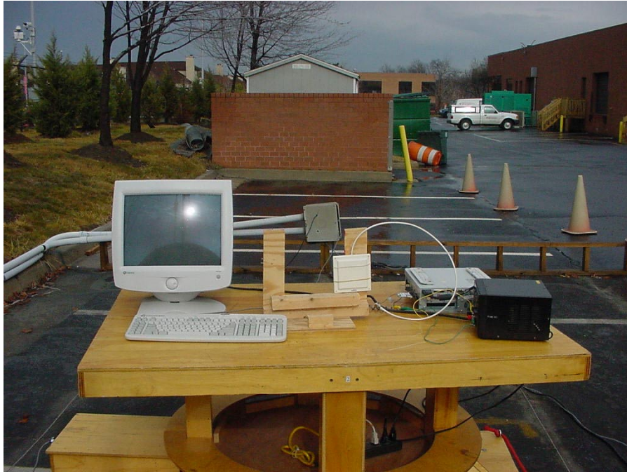
PHOTOGRAPH 6: RADIATED EMISSION REAR VIEW AIR-ANT3549