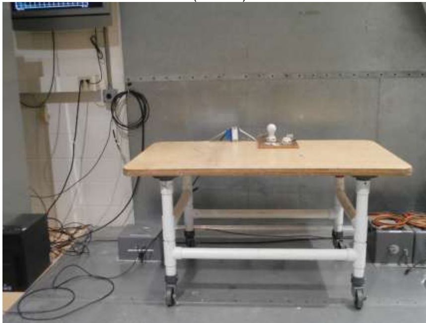
LINE CONDUCTED EMISSION (BACK)