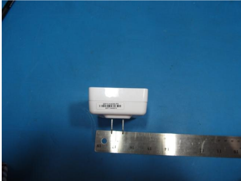
Figure 1-3: Top View