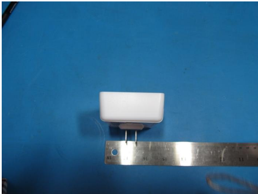
Figure 1-4: Bottom View