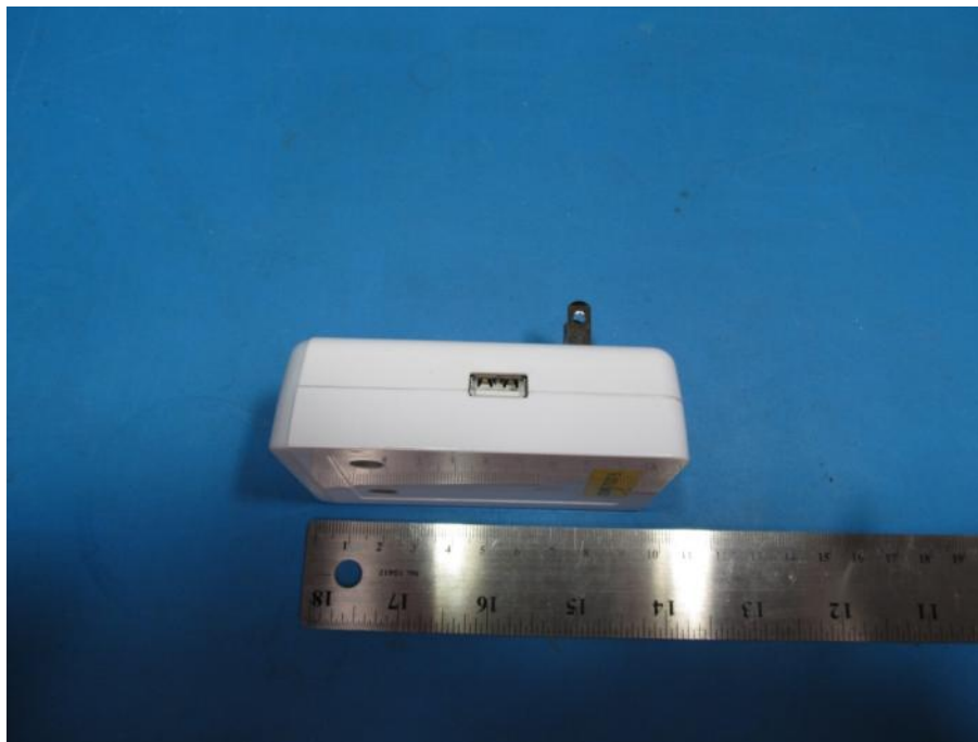
Figure 1-5: Left Side View