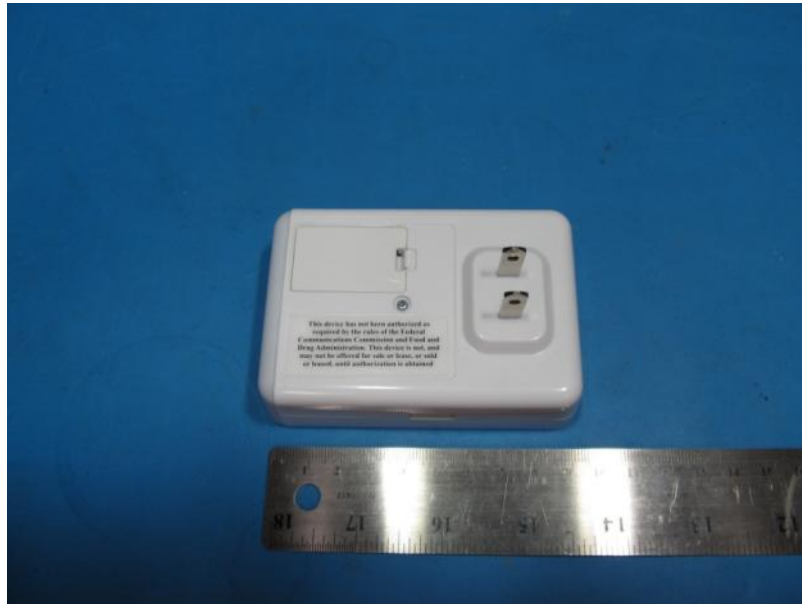
Figure 1-1: Rear View