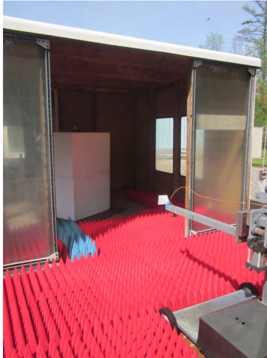
Horizontal Antenna Polarization, 18 GHz to 25 GHz, Horn