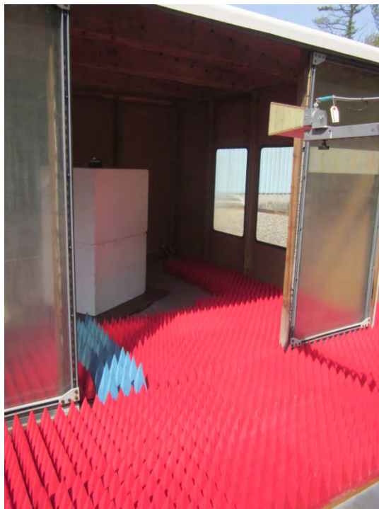
Vertical Antenna Polarization, 1 GHz to 18 GHz, Double Ridge Guide