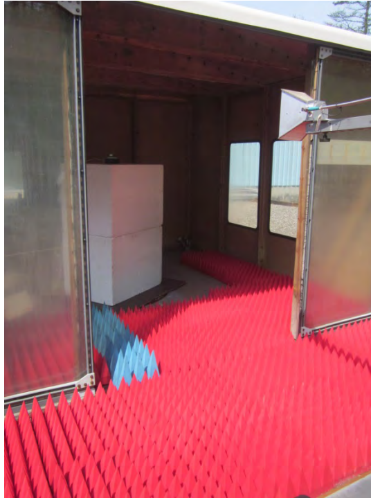
Horizontal Antenna Polarization, 1 GHz to 18 GHz, Double Ridge Guide