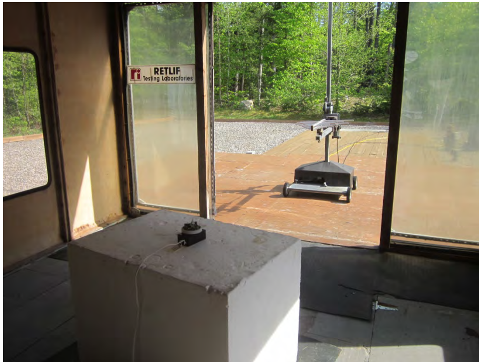
Horizontal Antenna Polarization, 200 MHz to 1 GHz, Log Periodic