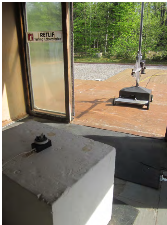
Vertical Antenna Polarization, 200 MHz to 1 GHz, Log Periodic