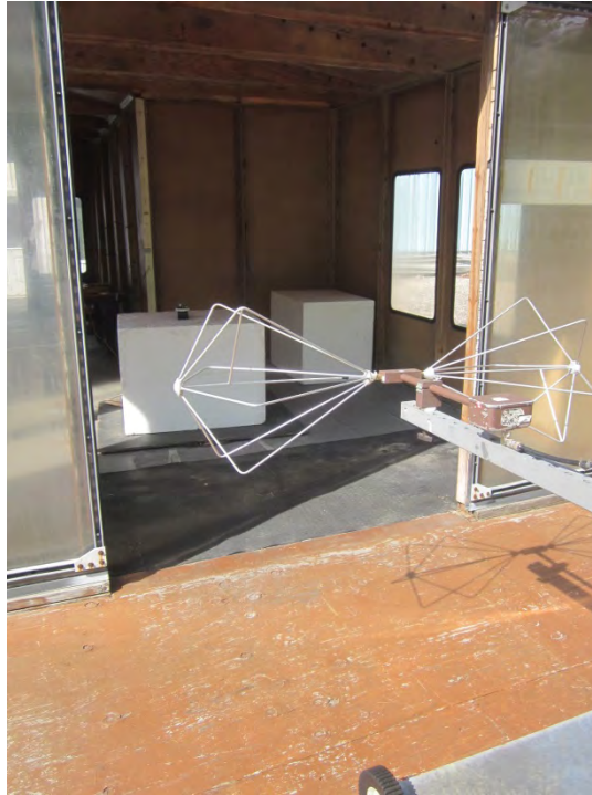
Horizontal Antenna Polarization, 30 MHz to 200 MHz, Biconical Antenna