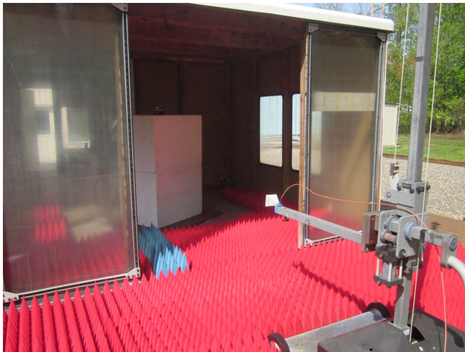
Vertical Antenna Polarization, 18 GHz to 25 GHz, Horn