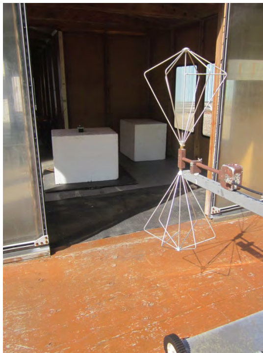
Vertical Antenna Polarization, 30 MHz to 200 MHz, Biconical Antenna