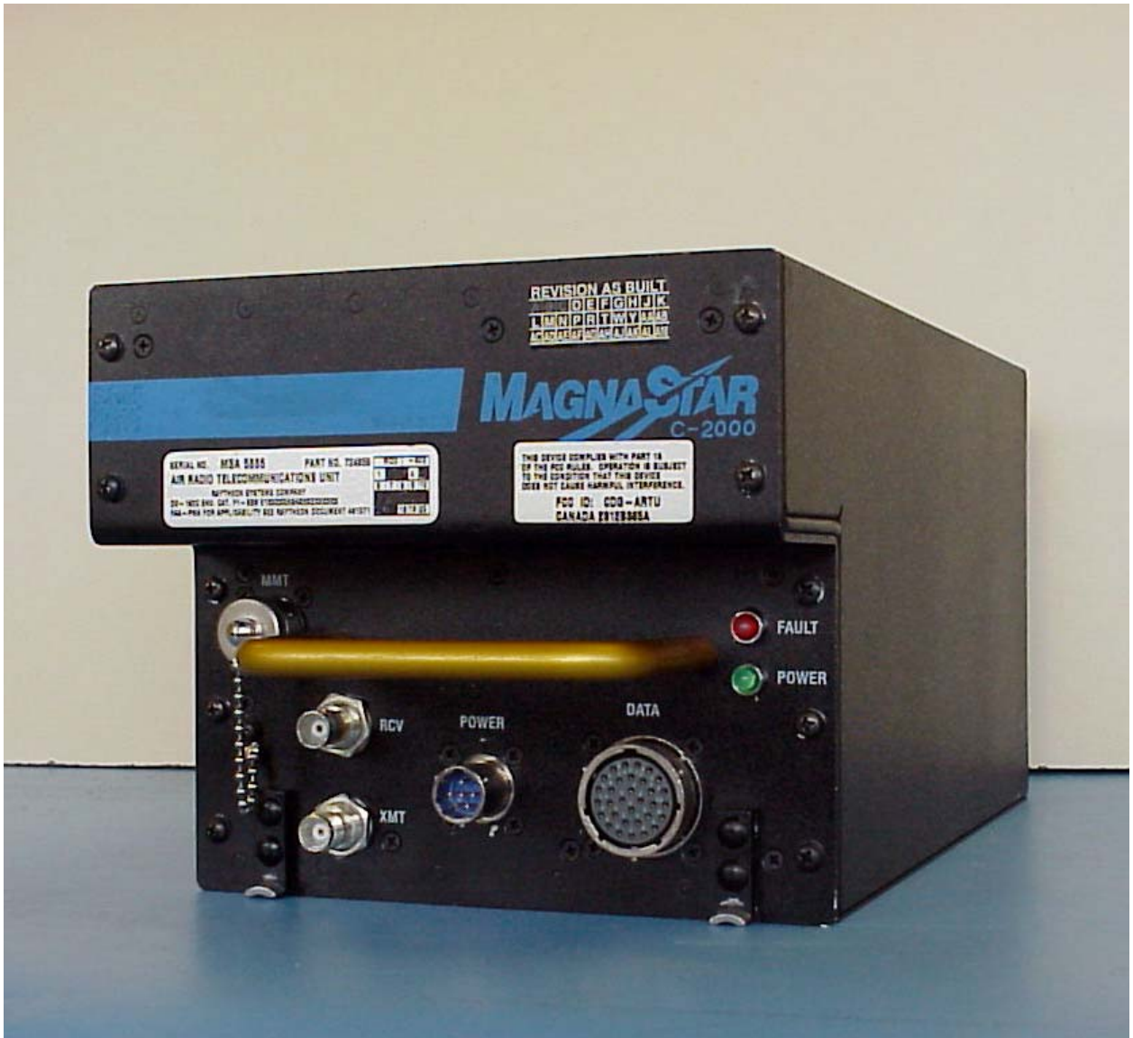
ARTU Front View