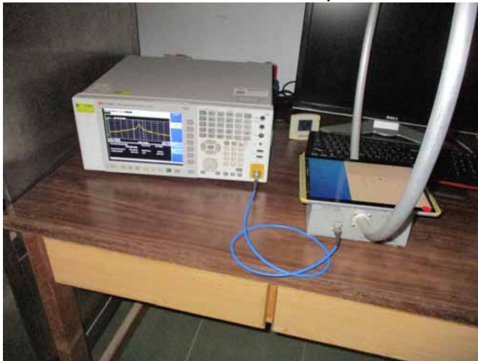
Frequency stability Setup Photo