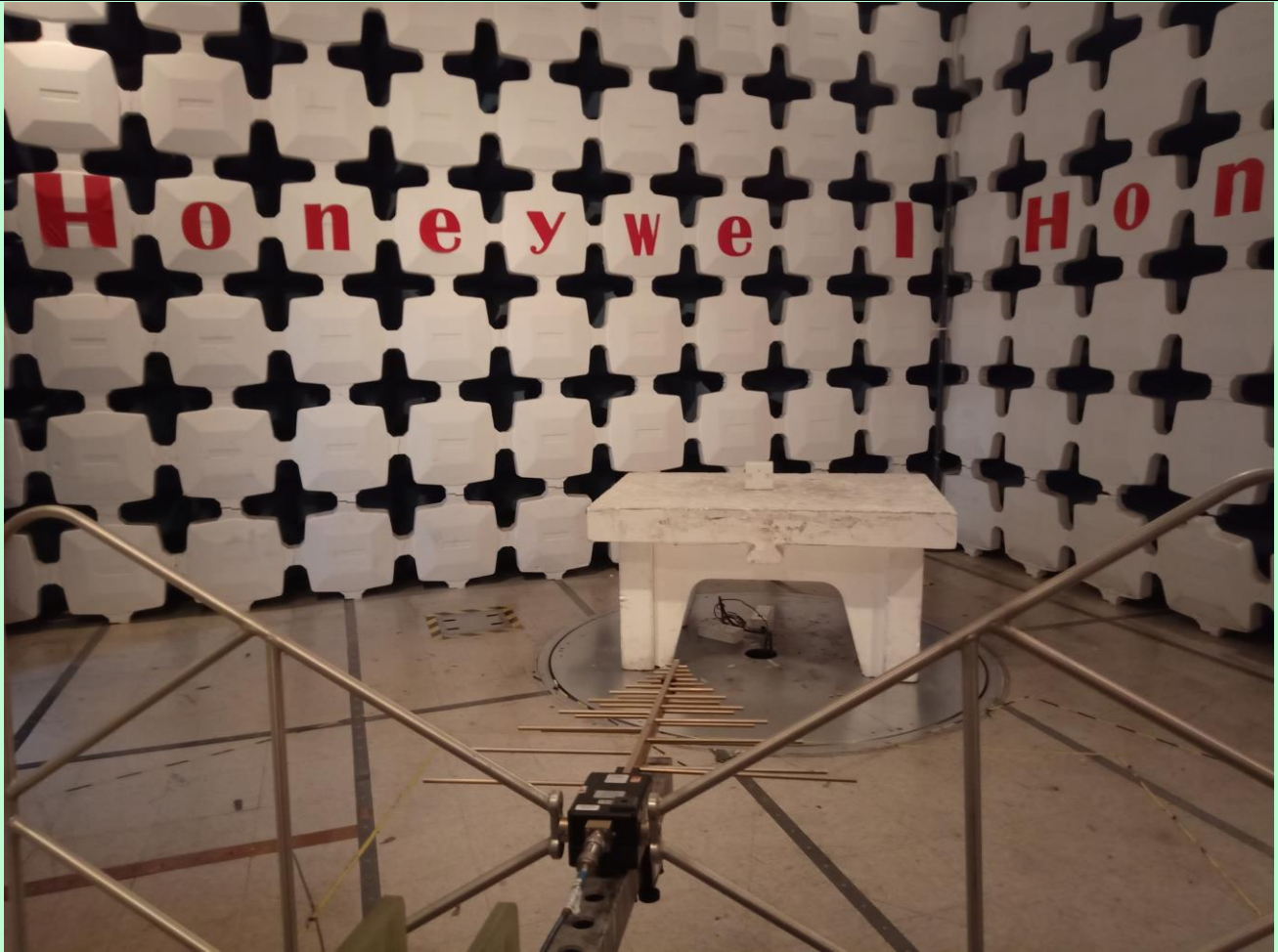
Radiated Emission Setup –30 MHz to 1 GHz [Horizontal polarization Polarization]