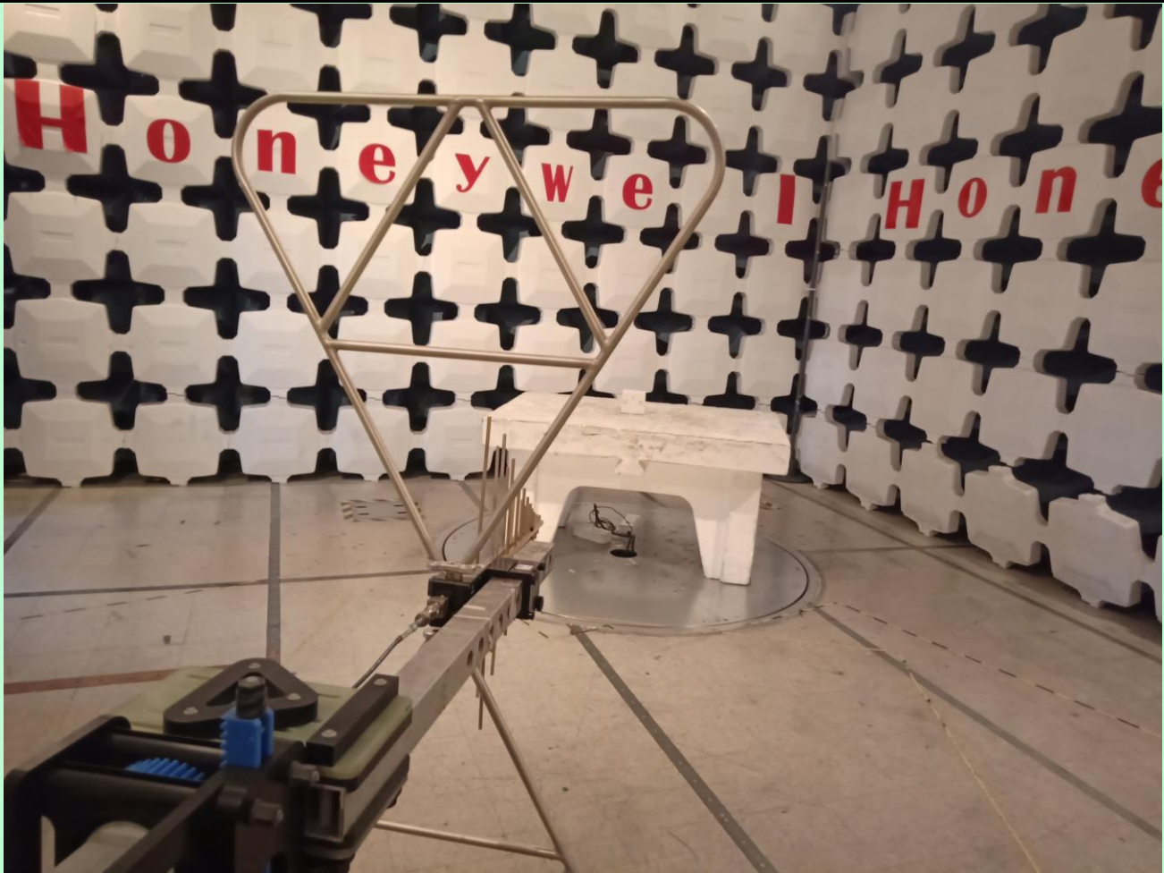
Radiated Emission Setup –30 MHz to 1 GHz [Vertical Polarization]