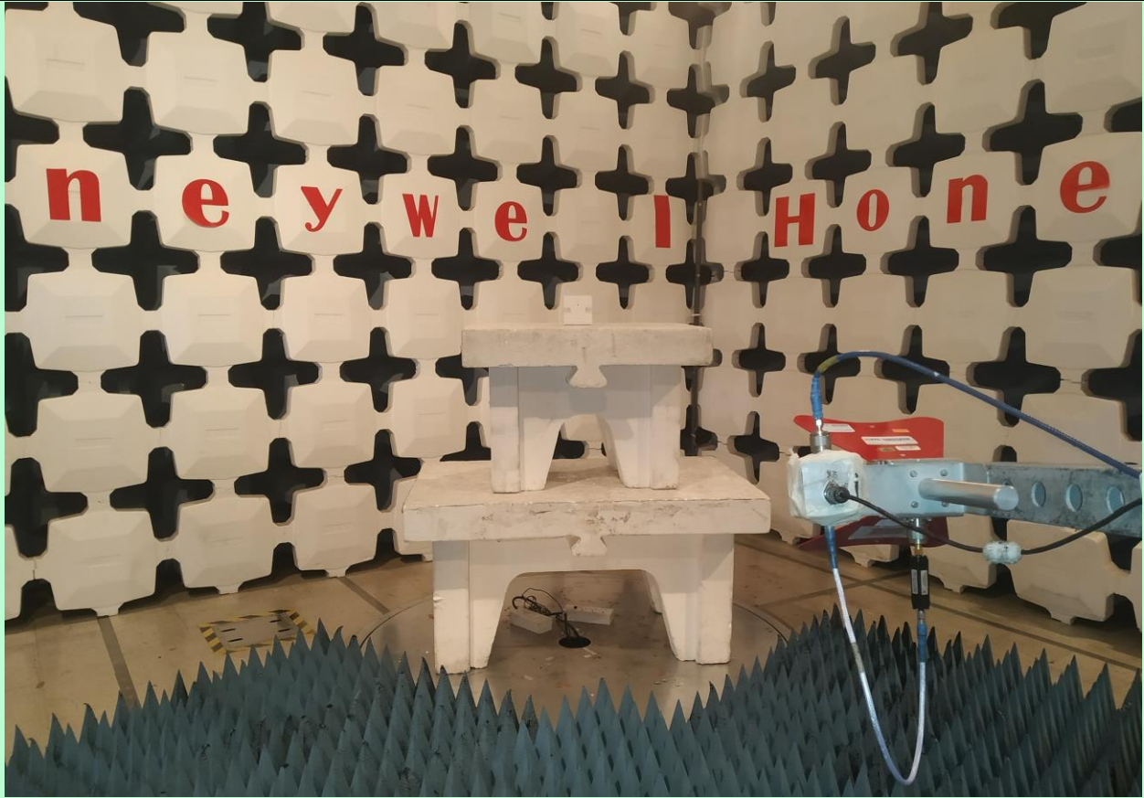
Radiated Emission Setup –1 GHz to 10 GHz [Vertical Polarization]