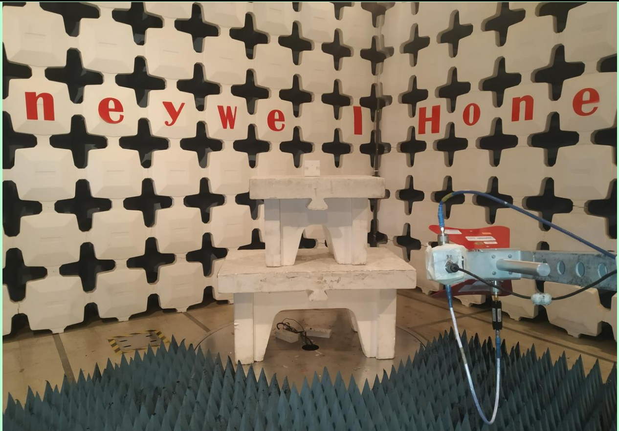
Radiated Emission Setup –1 GHz to 10 GHz [Vertical Polarization]