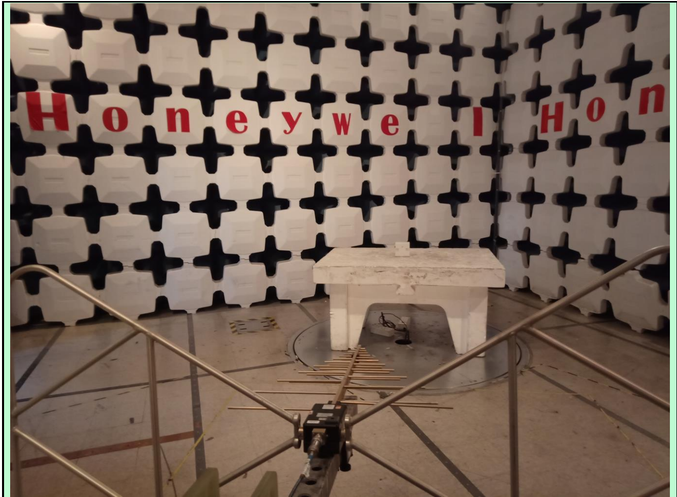
Radiated Emission Setup –30 MHz to 1 GHz [Horizontal polarization Polarization]