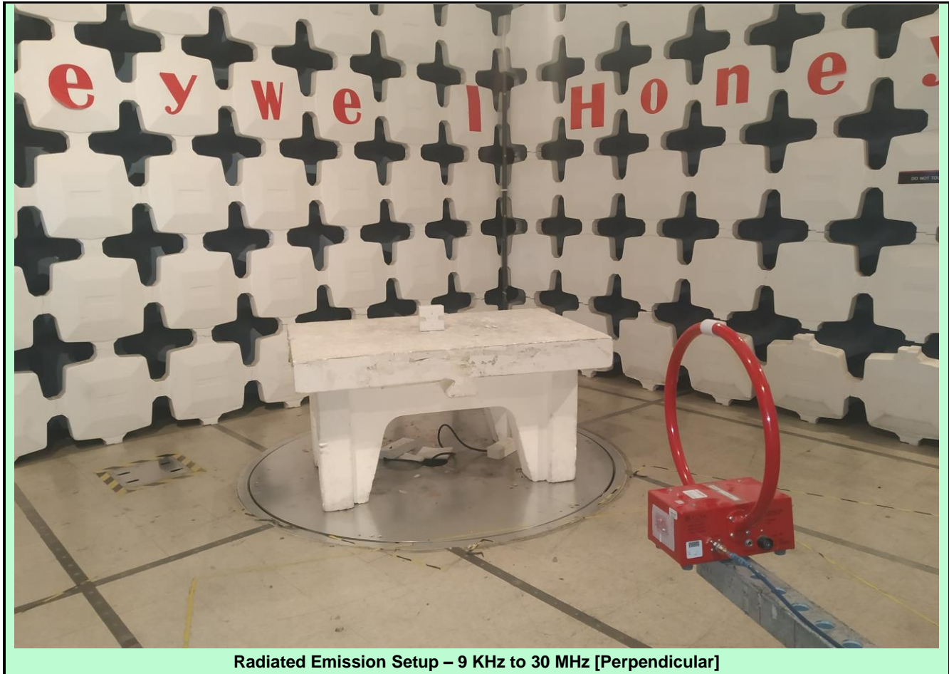
Radiated Emission Setup – 9 KHz to 30 MHz [Perpendicular]