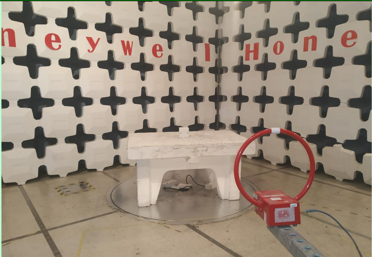
Radiated Emission Setup – 9 KHz to 30 MHz [Parallel]