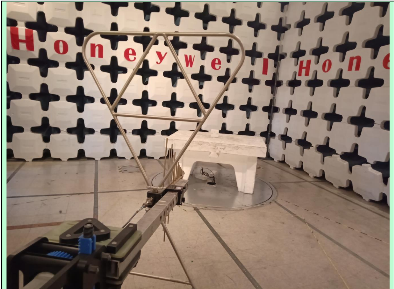
Radiated Emission Setup –30 MHz to 1 GHz [Vertical Polarization]