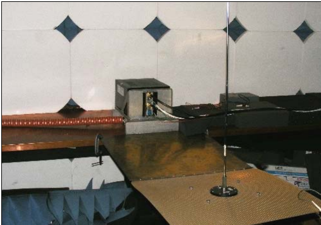
Figure 2 Field Strength of Spurious Radiation Setup (2 MHz to 25 MHz)