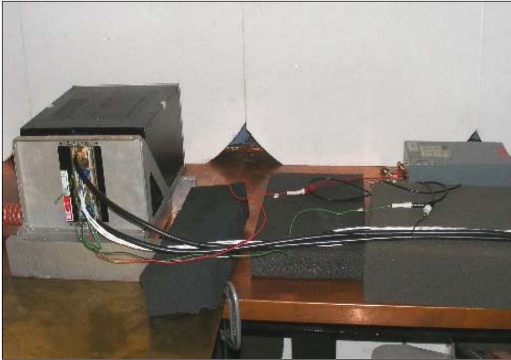
Figure 1: Field Strength of Spurious Radiation General Setup