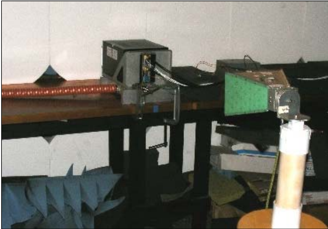
Figure 5: Field Strength of Spurious Radiation Setup (1 GHz to 18 GHz)