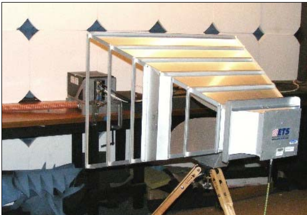
Figure 4 Field Strength of Spurious Radiation Setup (200 MHz to 1 GHz)