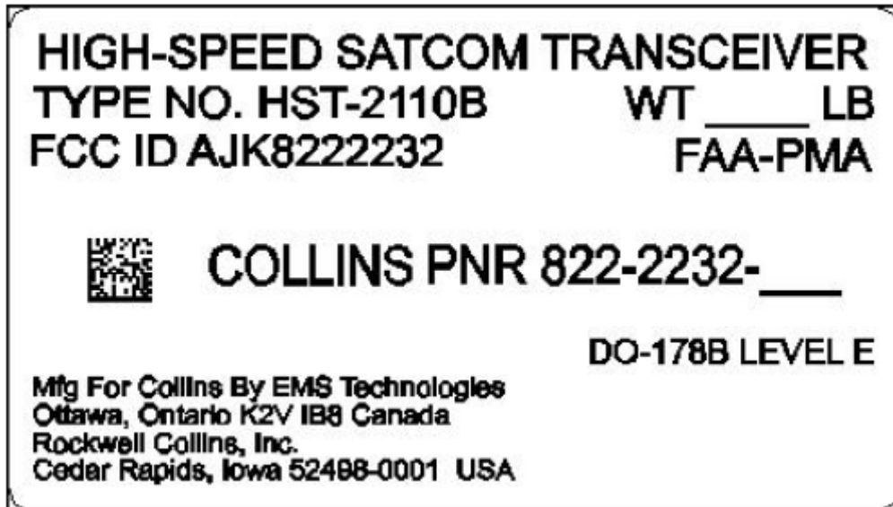
Figure 1 – Nameplate

The following details the front panel nameplate proposed for the HST-2110B. A diagram depicting the nameplate location on the unit is also included.