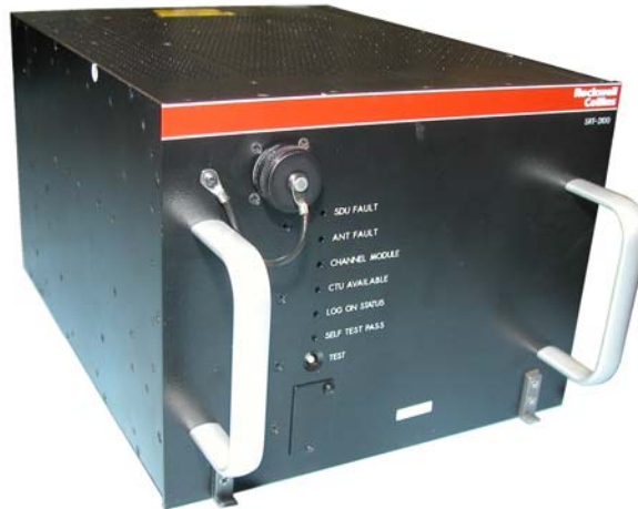
Figure 1.1 SRT-2100 Satellite Receiver/Transmitter

The SDU function of the SRT-2100 is the interface to all other aircraft systems. It contains all data processing functions, modems and channel tuning synthesizers including a voice CODEC (coder-decoder) and synthesizer pair for each voice channel.