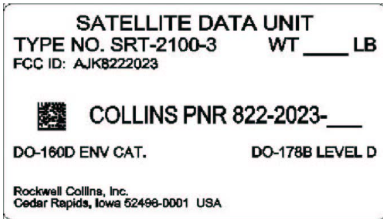
Figure 8.1 Nameplate label

A Serial Number/Modification Plate are also shown for reference only.