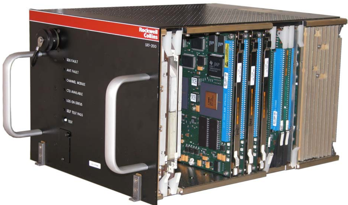
Figure 7-2. SRT-2100 With Side Cover Removed