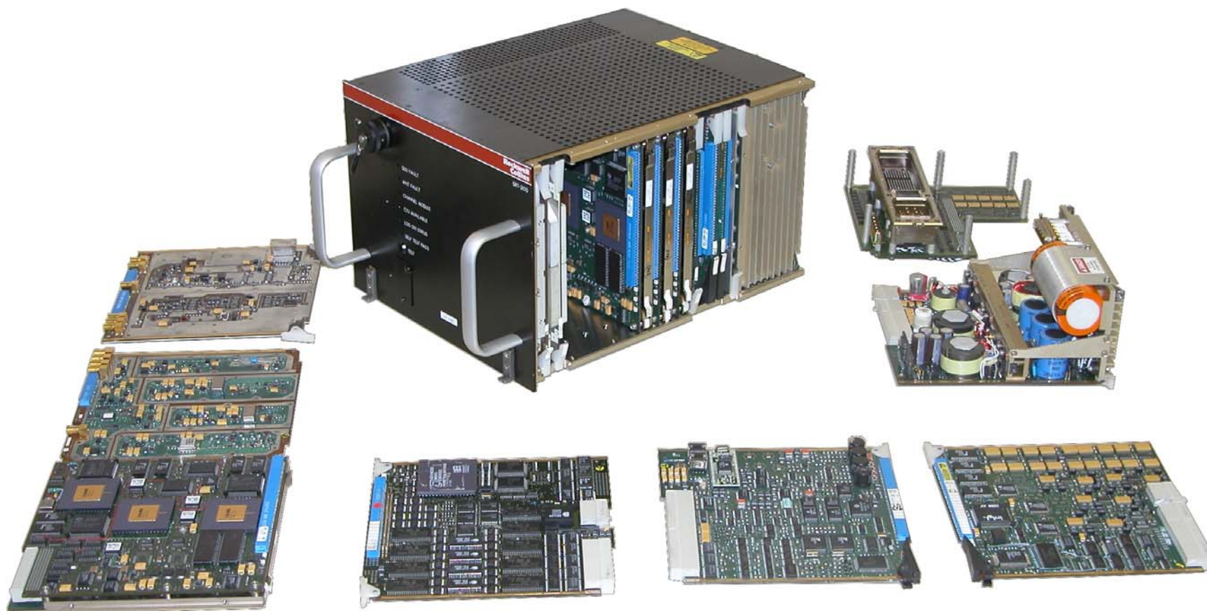
Figure 7-3. SRT-2100 Complement of Card Assemblies