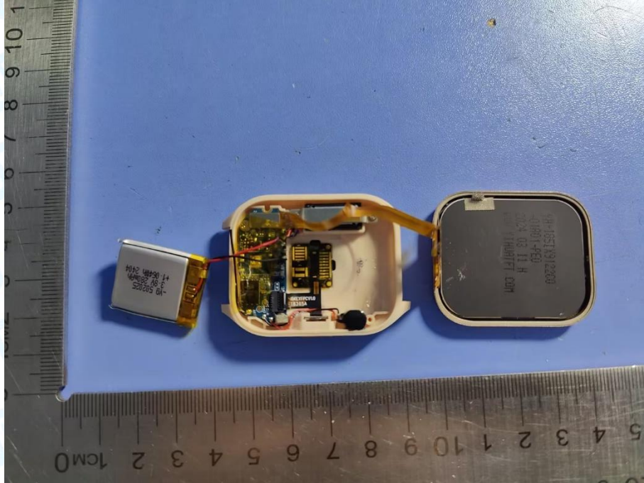
Photo 9 Appearance of PCB