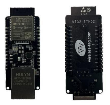
3.3 Pin Description