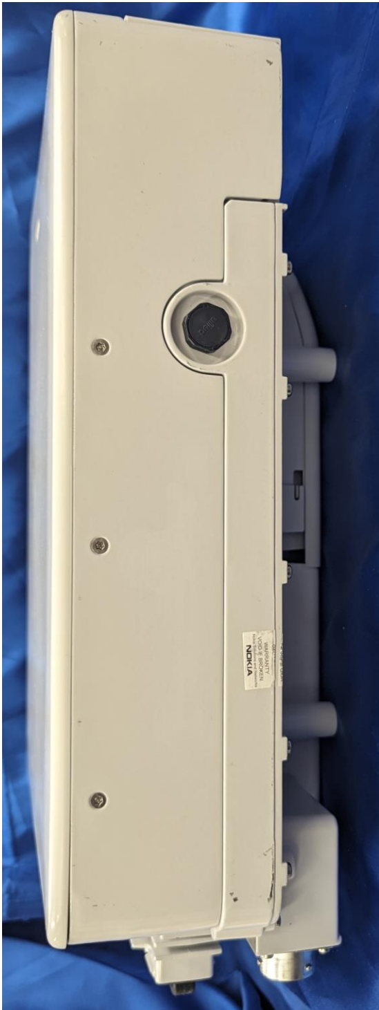
Right Side AWKUC/D (Base Unit)