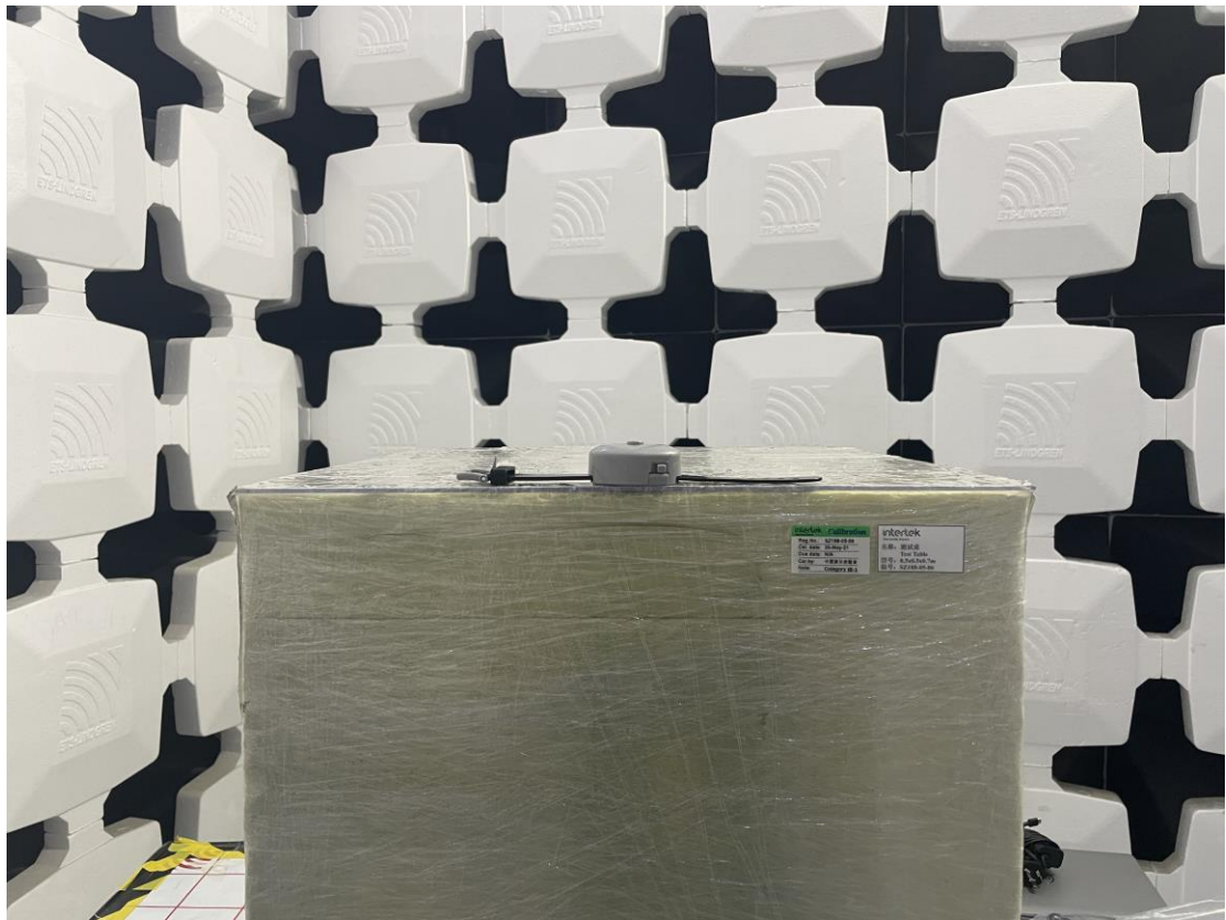
Above 1GHz (The EUT placed at the center of the turntable)